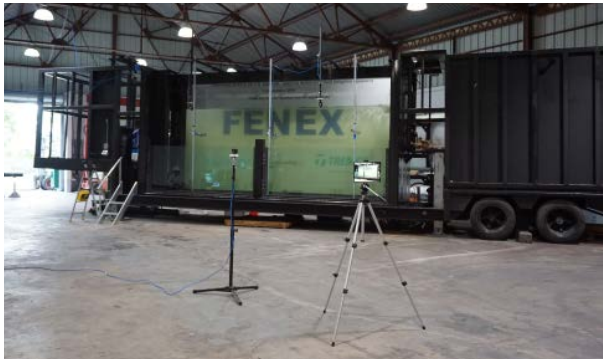
Load Test of 9' of water on 20' x 11' Flood Window