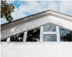
Fire & Ballistic Windows