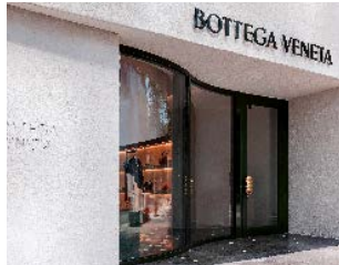
Oversized & Curved Windows