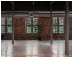
Historical Flood Window Application