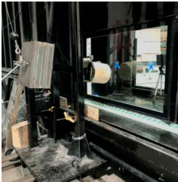
Impact Test on 4' x 6' Flood Window

Tested To Exceed ANSI/FM 2510 Standards For Impact Up To 1000 lbs