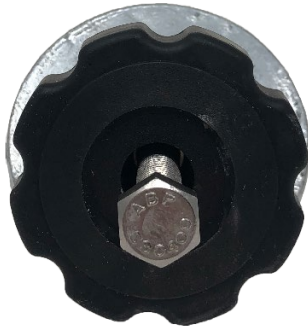
Close Up of Easy-Turn Knob