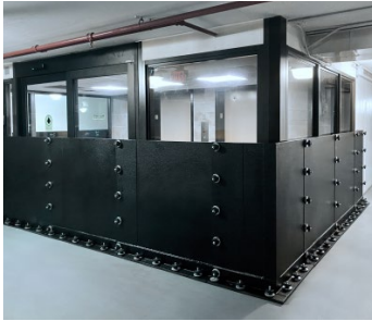
Extended Run Barrier With Corner