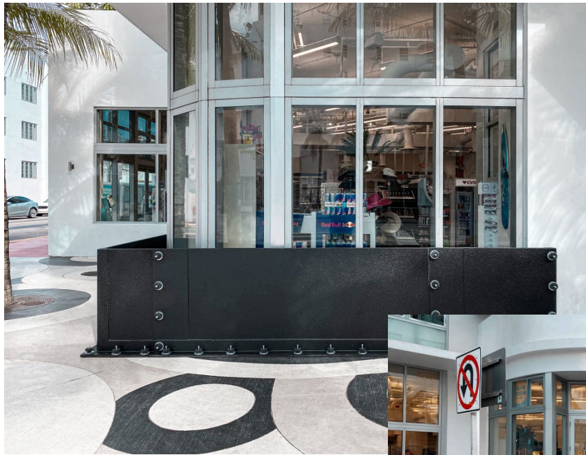
Storefront Protection Door & Window Barrier

The Flood Risk America (FRA) Flood Panel uses sustainable flood-seal technology to protect any opening against flood water & is highly resistant to heavy impact forces. Each panel is custom-engineered to meet individual installation requirements & job-specific demands. It is easy to install, deploy, & remove.