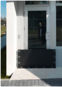
Single Door Barrier