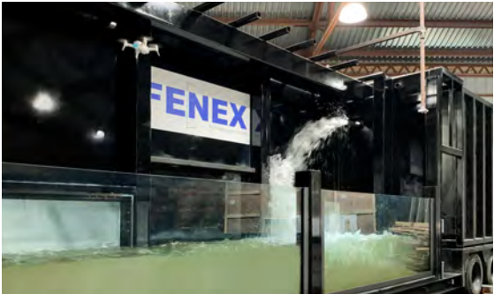
Filling Custom-Built Test Rig