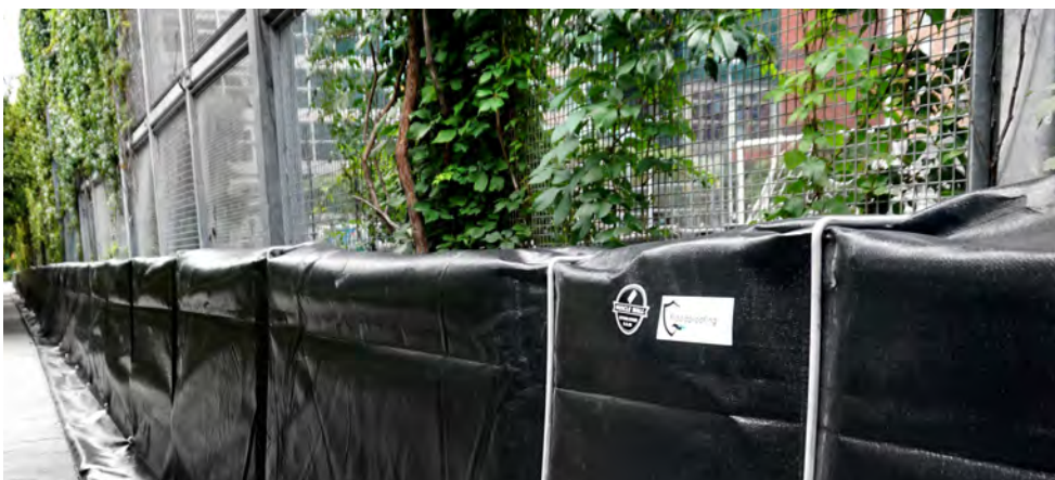
Muscle Wall Protecting Battery Park in New York City (Using Wrap Liner Option)