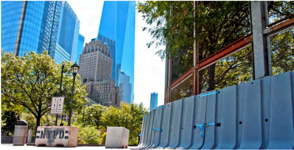
Muscle Wall Protecting Battery Park in New York City