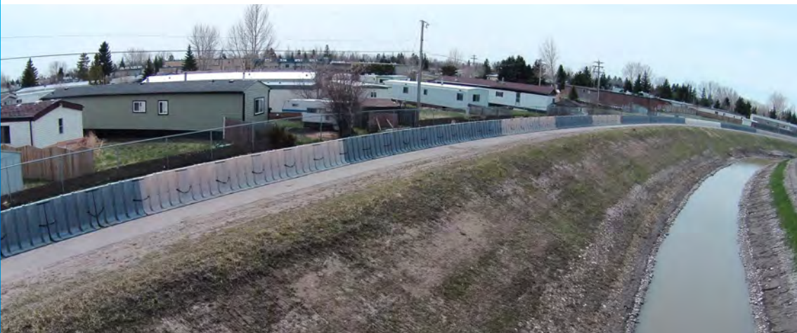
Extended Run of Muscle Wall

Muscle Wall can replace thousands of sandbags all while being quick, easy, reusable, reliable, + customizable. It is engineered to withstand the immense force of rushing or standing water due to its patented toe design.