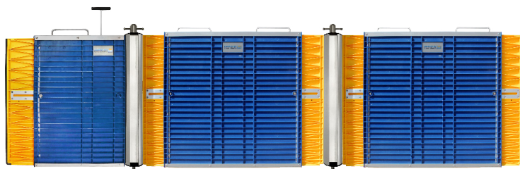
1 MINI + 2 STANDARD SINGLE GARAGE 67.65"-119.35"