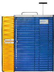
MINI BARRIER 20"-26.5"

Connectable Extension Poles for Wider Openings