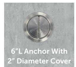
6"L Anchor With 2" Diameter Cover