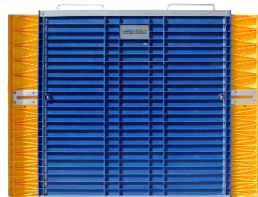
STANDARD BARRIER 30.7"-43.4"