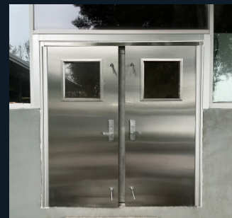
Flood Panel Watertight Door