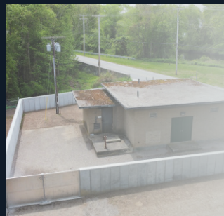
Flood Panel Flood Gate