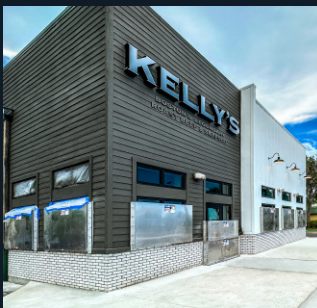
Flood Panel Flood Shield