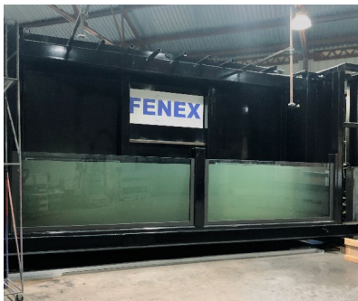
4x8' Sections Holding 4' of Water